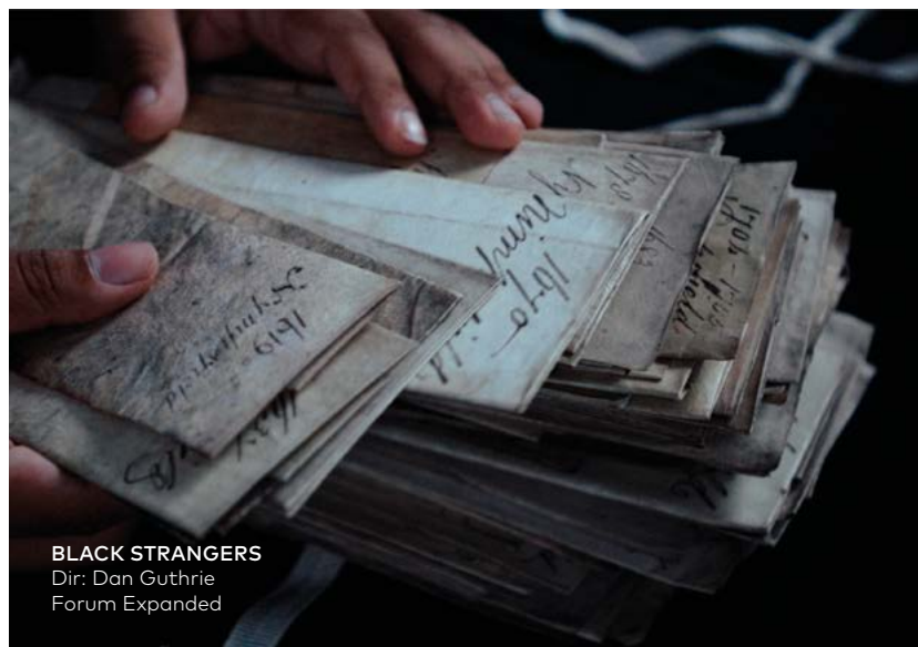
BLACK STRANGERS Dir: Dan Guthrie Forum Expanded