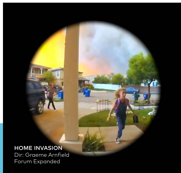
HOME INVASION Dir: Graeme Arnfield Forum Expanded