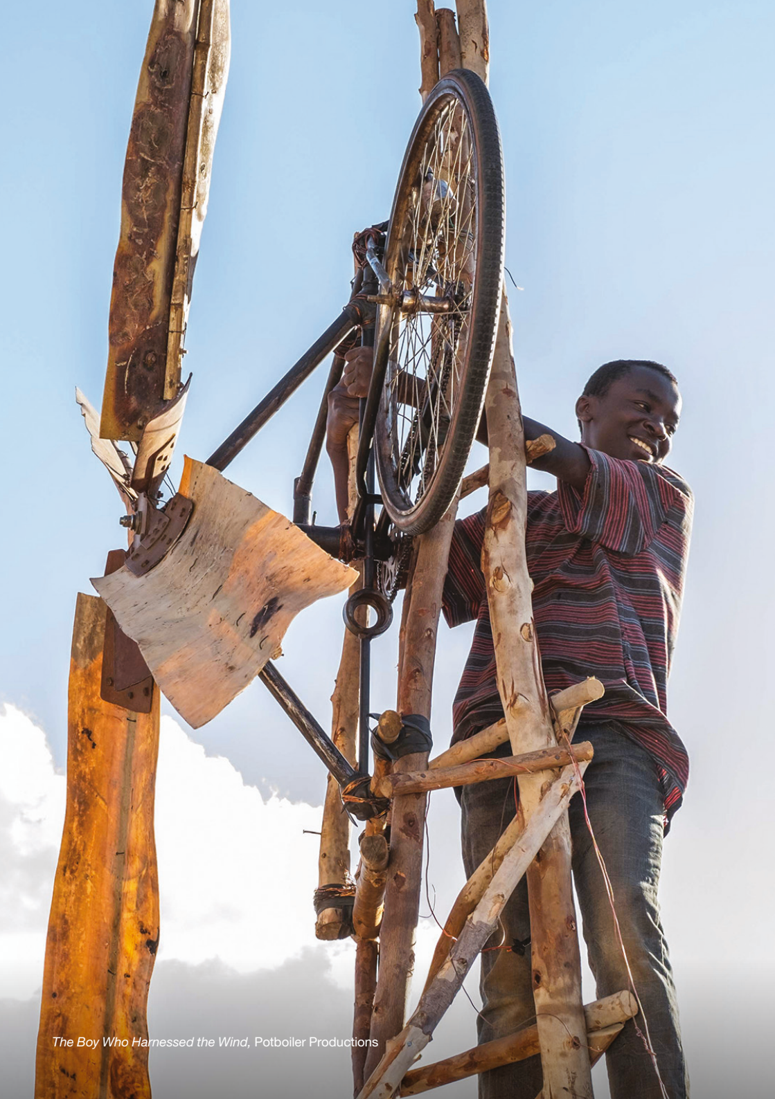
The Boy Who Harnessed the Wind, Potboiler Productions